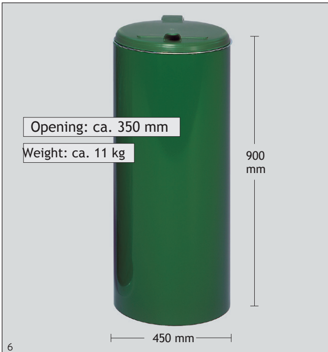
Pic.: Compact junior, green coated, Art.-No. 1000