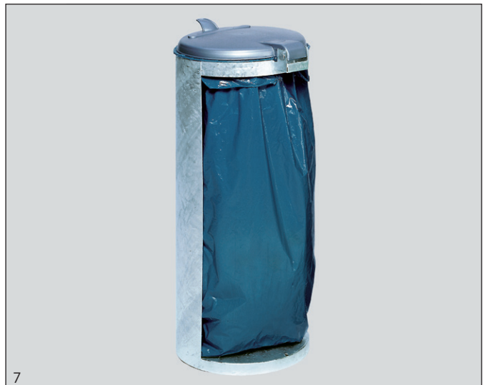
Pic.: Compact junior, hot galvanized, Art.-No. 1001