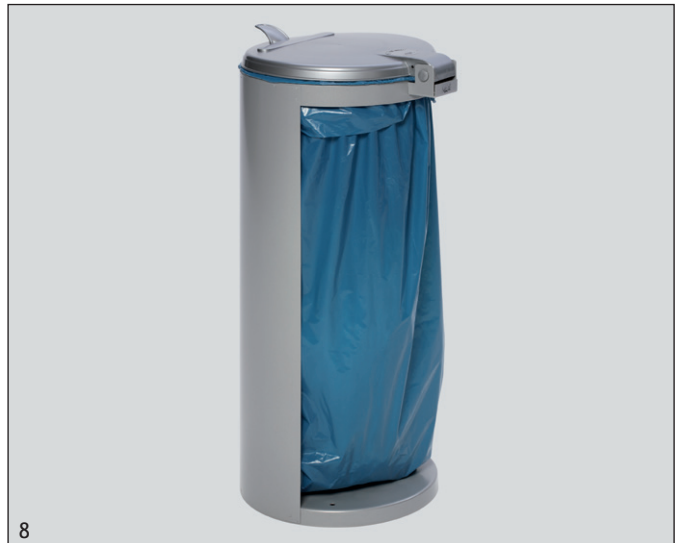
Pic.: Compact junior, silver coated, Art.-No. 10012