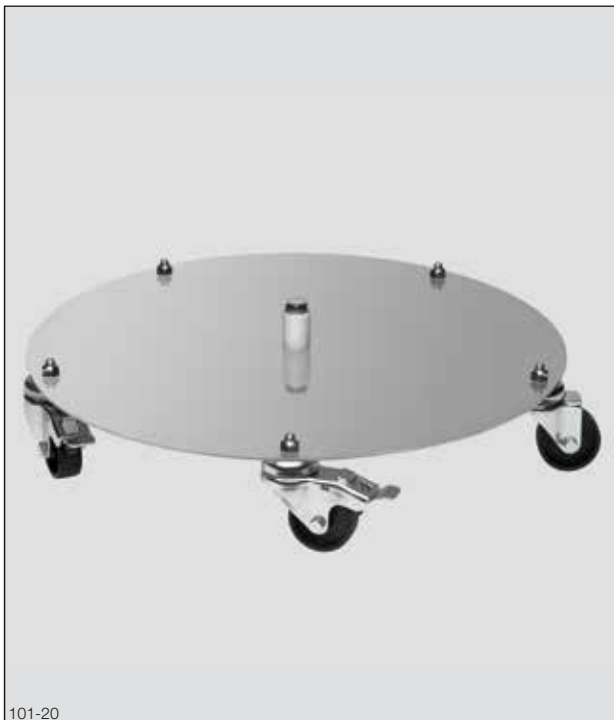
Picture: race, stainless steel, 5 sheaves Art.-No. 1156