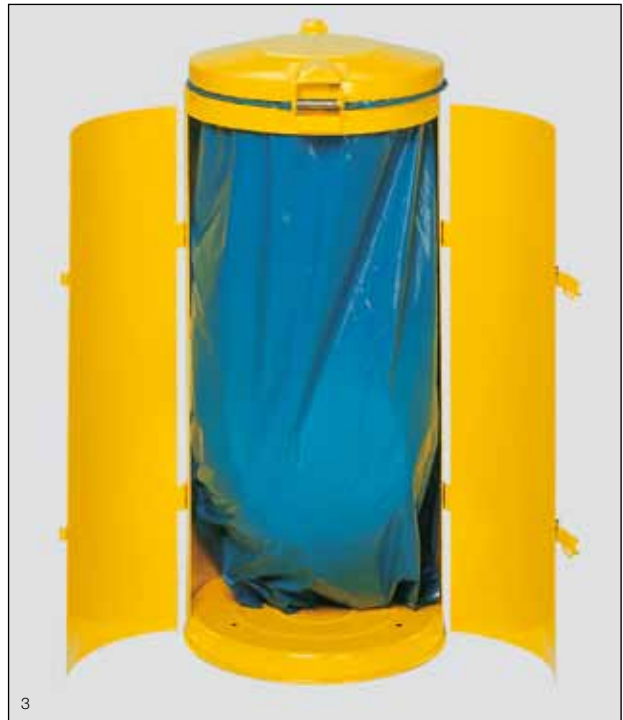
Picture: compact-double door, yellow coated, Art.-No. 1066