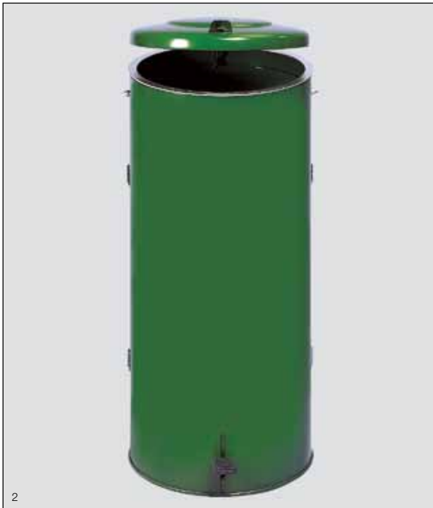
Picture: compact-double door pedal, green coated, Art.-No. 1081, with practical foot pedal actuation (only in green available.)