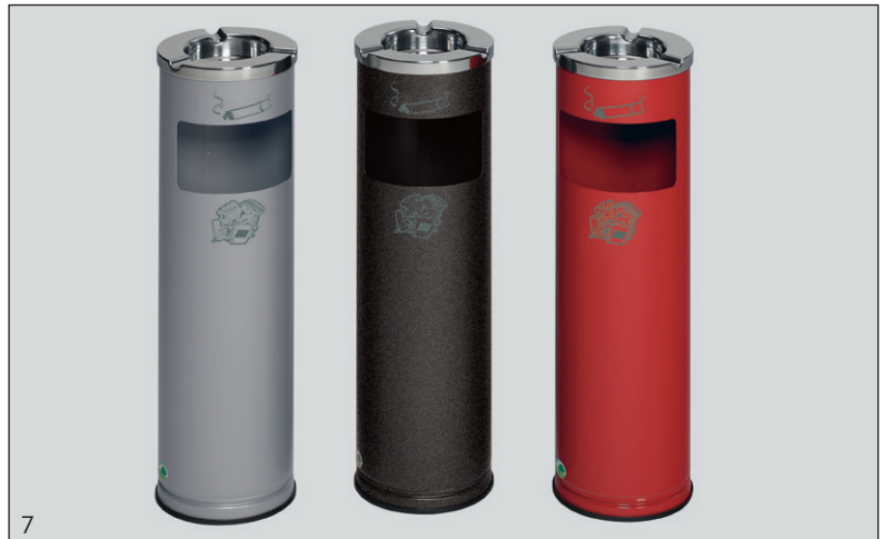
Pic.: ashtray/ waste collector D 20

All versions include floor sparing edge protection.