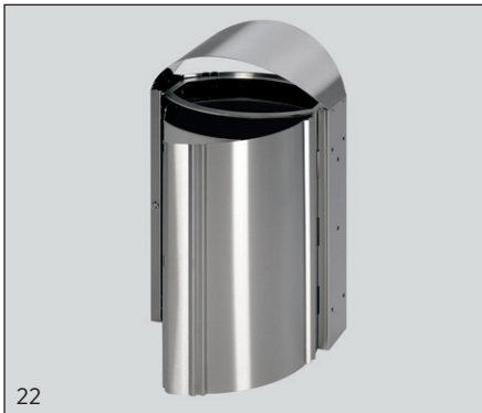
Pic.: Art.-No. 28111

Standing waste collector with advertising space with two lockable ashtrays Ashtray with stainless steel console and double-bit key lock, capacity ca. 3,5 ltr. Inside bin made of galvanized steel sheets, capacity ca. 50 ltr. Water sheltered advertising space. Weather resists back wall made of polystyrene. Waste collector with four supports. Delivery completely mounted. (Art.-Nr.: 28113)