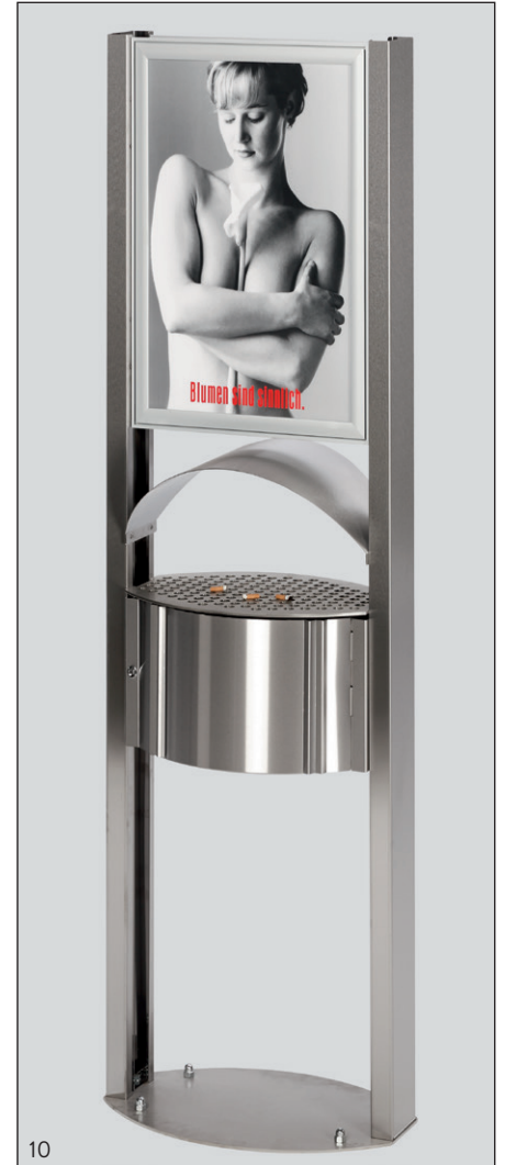
Pic.: Art.-No. 28100