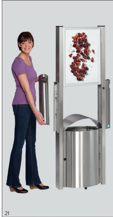
Pic.: Art.-No. 28113