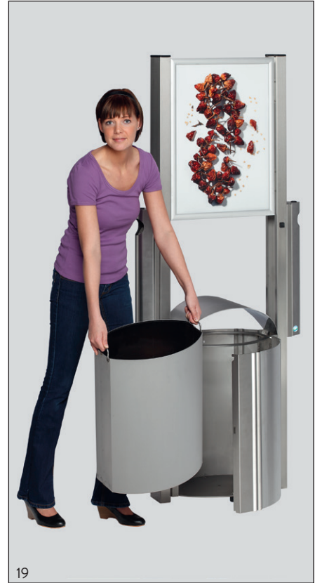
Pic.: Art.-No. 28113

Standing waste collector with advertising space Inside bin made of galvanized steel sheets, capacity ca. 50 ltr. Equipped with two aluminium frames DIN A2. Water sheltered advertising space. Weather resists back wall made of polystyrene. Waste collector with four supports. Delivery completely mounted. (Art.-Nr.: 28112)