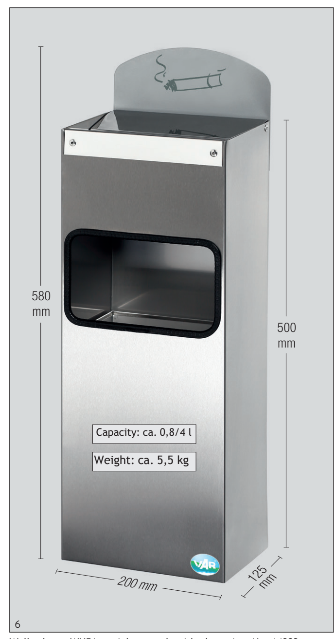
Wall ashtray WH51, stainless steel, with plate, Art.-No. 14983

Execution: Corpus and ashtray insert or inside bin (WH51) made entirely of stainless steel. Corpus stainless steel, insertion plates polished stainless steel. Plate made of galvanized steel sheets, silver powder coating. Delivery includes fitting material for wall fixation and pictogram labels.